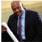
Dwight Stephenson CEO, D. Stephenson Construction, Inc. NFL Hall of Famer