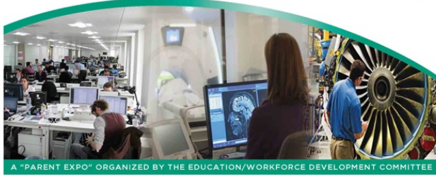
A "PARENT EXPO" ORGANIZED BY THE EDUCATION/WORKFORCE DEVELOPMENT COMMITTEE